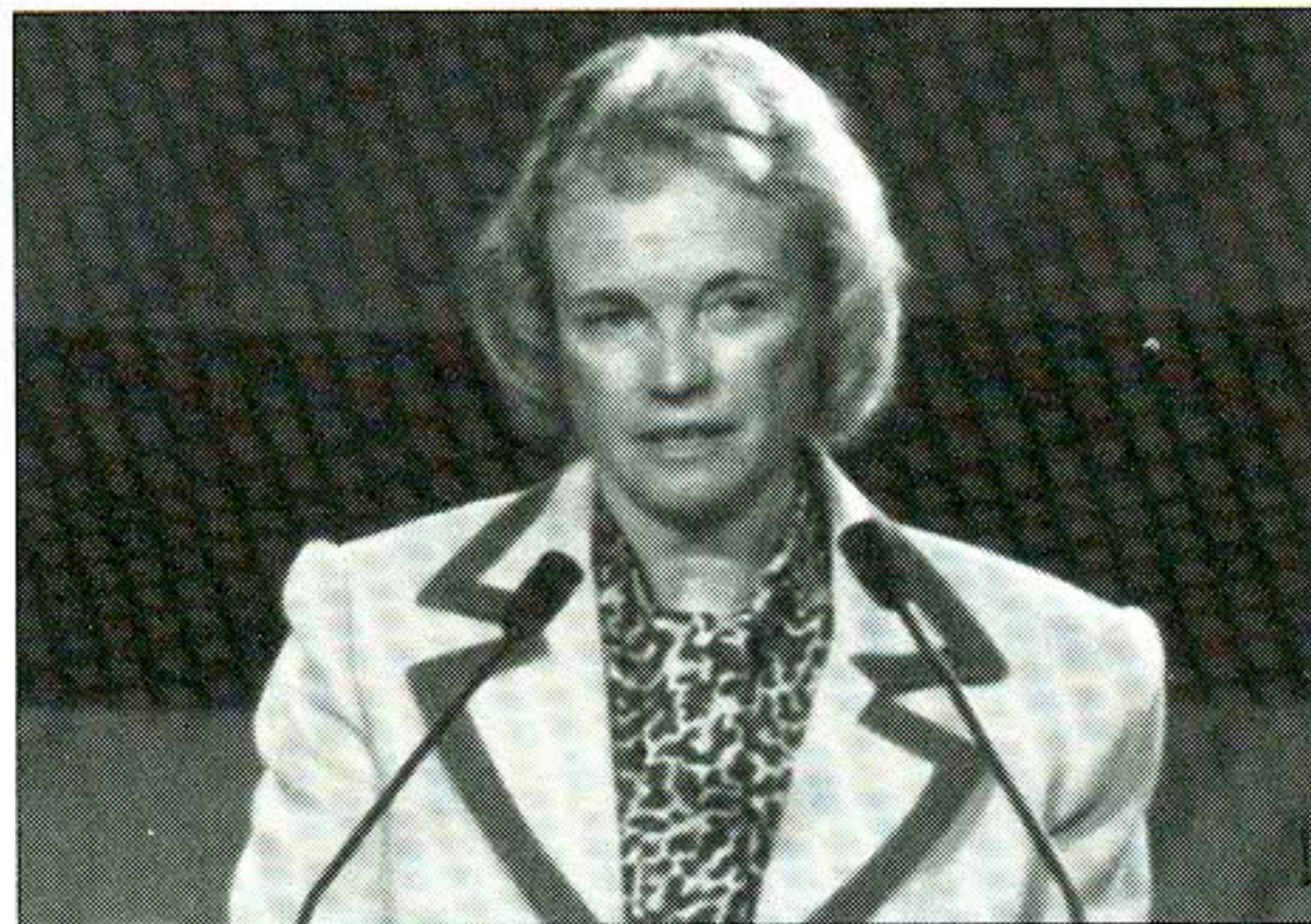
Sandra Day O'Connor.

In February 1988, more than 1,500 participants gathered in Atlanta for a historic symposium convened by former First Ladies Rosalynn Carter and Lady Bird Johnson and supported by Betty Ford and Pat Nixon. "Women and the Constitution" brought together leading female scholars and political figures from all 50 states and 10 foreign countries to examine women's roles in U.S. history, politics and policies. "One of our goals," said Mrs. Carter, "was to leave a legacy for our children and grandchildren." Now that legacy is here.