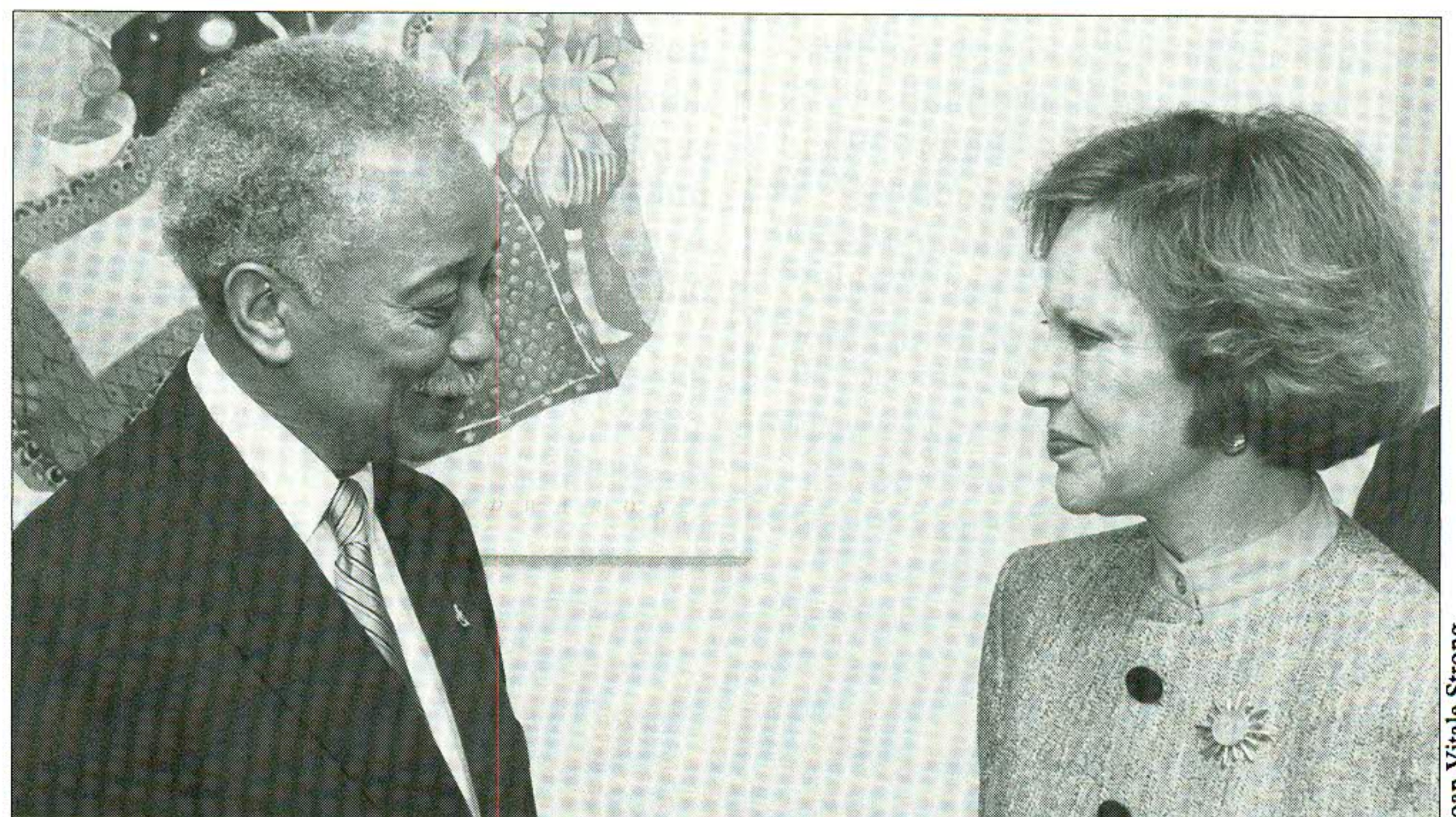
Mrs. Carter and New York City Mayor David Dinkins dedicated an affordable outpatient mental health residence this spring in NYC.

The project is funded by the John D. and Catherine T. MacArthur Foundation, which chose mental health as one of its first program priorities in 1979. ■