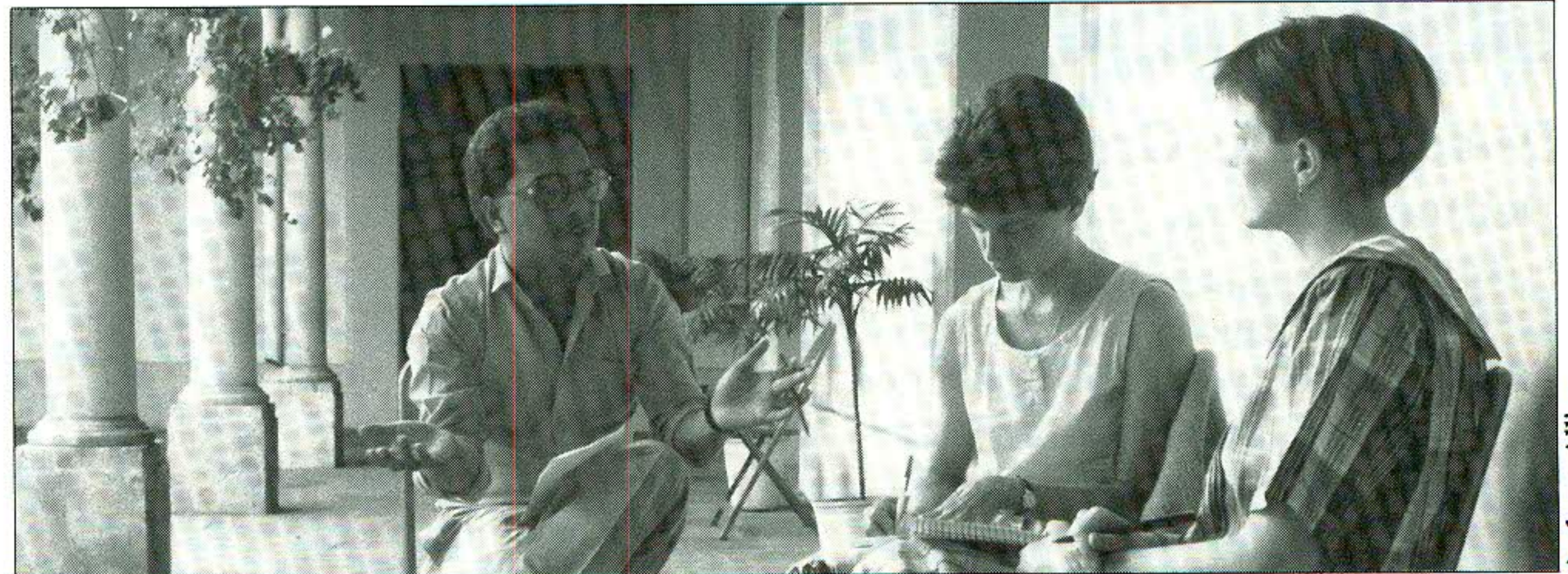
A human rights activist in Guatemala describes a peasant woman's death at the hands of government agents.