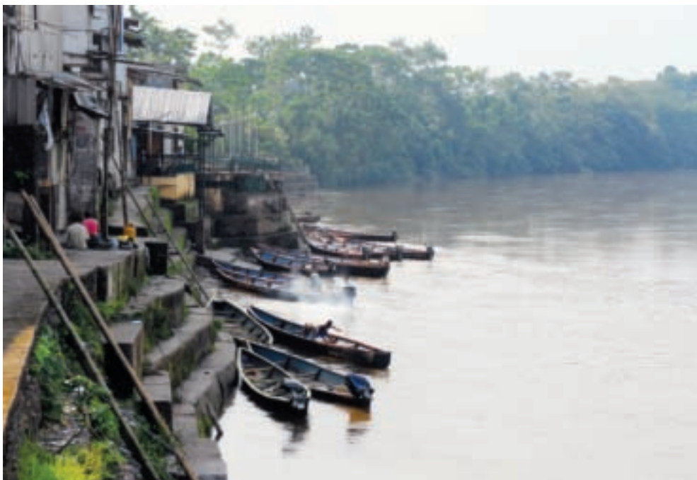
The town of General Farfan, home to many Colombian refugees, is located directly on the Ecuador border.