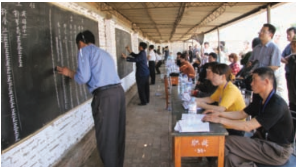
Results are tallied following elections in Shidong village, China, in 2006.

The Center also sponsors http://www.chinarural.org/ , the most comprehensive Web site on village elections and villager self-government in China.