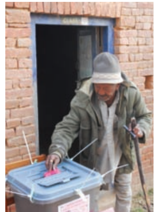
In Bhaktapur, a woman presents her identification card before voting (left) and a man casts his vote for the Nepal’s constituent assembly (above).

Nepal’s constituent assembly elections were the 70th elections observed by The Carter Center. All Carter Center reports on Nepal’s election process are available at www.cartercenter.org .