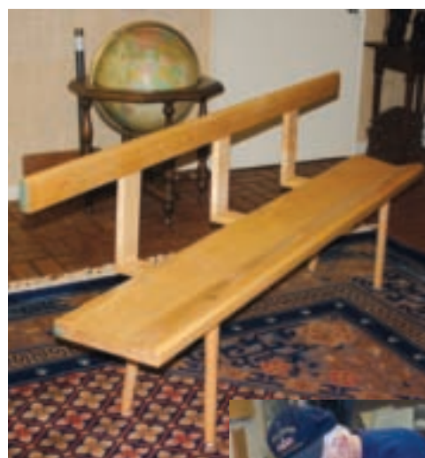
Maple bench handcrafted by President Carter

This bench made of hard maple wood handcrafted by former U.S. President Jimmy Carter sold for $300,000 at an auction in Port St. Lucie, Fla., on Feb. 9 to benefit The Carter Center. Items in the silent and live auctions combined raised $1.2 million for the Center.