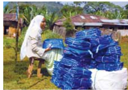
The Carter Center's work to eradicate Guinea worm disease, which began in 1986, formed the foundation of our efforts to fight other diseases. Here, an Ethiopian woman distributes bed nets, which help prevent malaria and lymphatic filariasis.

As a growing global movement toward democracy brought demands for independent election observers, the Center pioneered the field of election observation, monitoring some 90 elections in 36