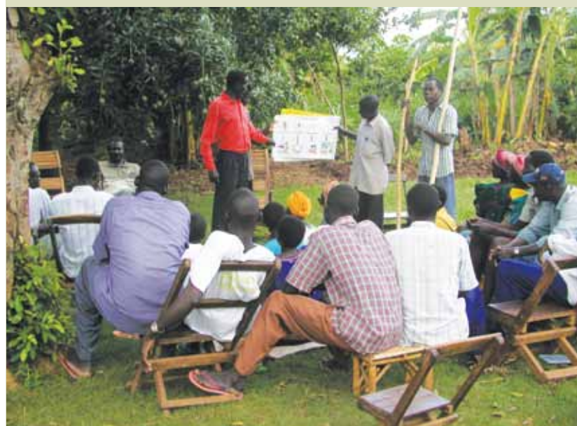
Community drug distributors attend training about river blindness. Usually retired civil servants or teachers, these distributors will ensure that the members of their community receive Mectizan to treat river blindness.