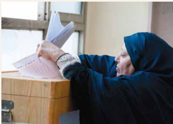
An Egyptian woman votes in the People's Assembly election.

Egyptian elections are occurring in stages; People's Assembly and Shura Council elections took place from November 2011 through February 2012, while the presidential election is scheduled for late May. The following donors supported Carter Center observation of the assembly and council elections: Norway provided $517,140 and the Norwegian Resource Bank for Democracy and Human Rights (NORDEM) provided $43,186 plus direct coverage of some expenses, Switzerland provided $474,667, the