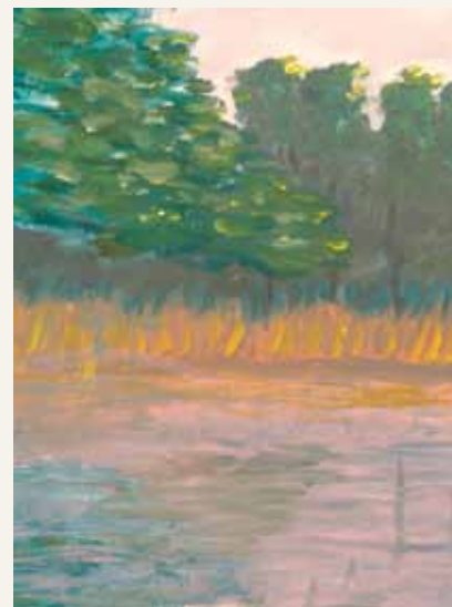
"Live Oak at Sunrise" by President Carter received the highest bid at the recent Winter Weekend auction to benefit The Carter Center. The oil painting shows a scene from the lake behind his mother's pond house and has been hanging in the Carter residence in Plains, Ga.

View items and their winning bids online at www.cartercenter.org/donate/winter_weekend/liveauction.asp .