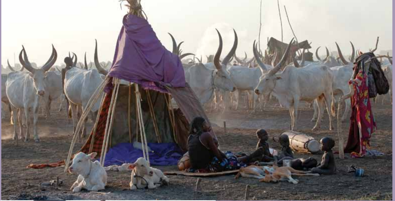
In Terekeka, South Sudan, babies play in a camp on the Nile River where cattle herders have migrated for water. Nomadic or transient populations present a challenge for the eradication of Guinea worm because the disease can be spread unknowingly through water, and the long incubation period makes the source difficult to trace when many groups of people move from place to place.