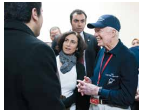
Former U.S. President Jimmy Carter talks with voters in Egypt. President Carter co-led the Carter Center delegation that observed the third round of parliamentary elections in January.

The ultimate success of Egypt's transition will depend on the earliest possible handover of power to a civilian government and an inclusive drafting of a new constitution protecting fundamental rights and freedoms and ensuring full civilian authority over the military.