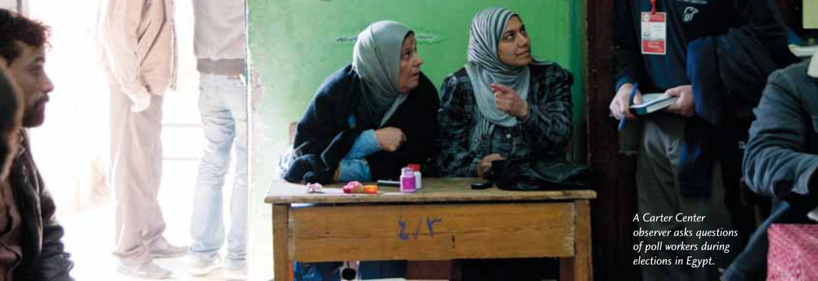
A Carter Center observer asks questions of poll workers during elections in Egypt.

The Carter Center witnessed Egypt's first free elections in the post-Hosni Mubarak era, sending observers to the country's upper and lower house parliamentary elections from November 2011 through February 2012.