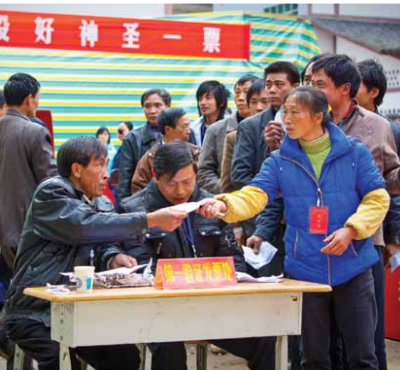
Chinese poll workers check a voter's registration in the village of Hetao.