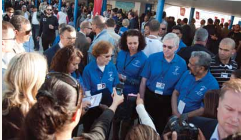
The leadership team from the Carter Center mission discusses the Tunisian elections with journalists.

For the May presidential election mission, the following donors have contributed a total of $1.56 million: the Swedish International Development Cooperation Agency, the United Kingdom, the Netherlands, Norway, Switzerland, and the British Foreign and Commonwealth Office.