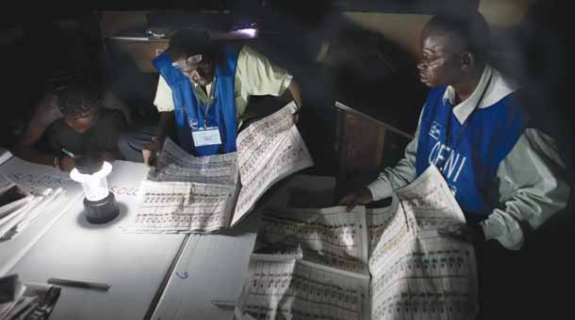
Left: Election workers count votes in Kinshasa, capital of the Democratic Republic of the Congo. Although overall voting was largely peaceful, counting and tabulation were problematic.