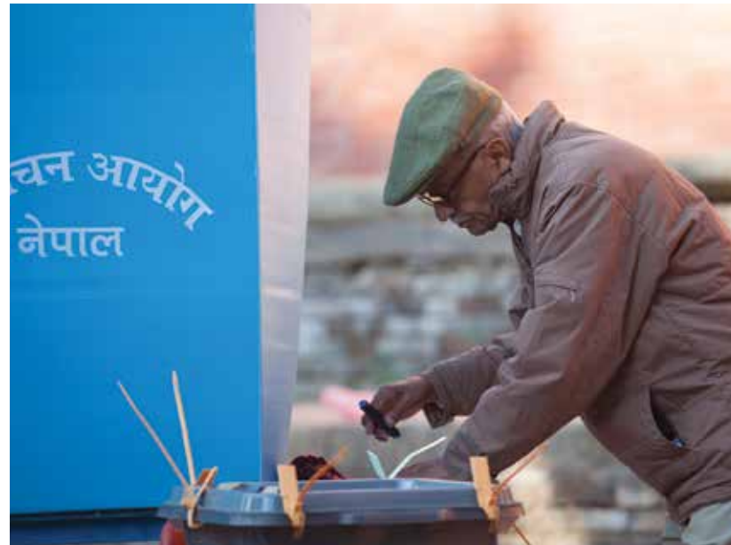
A Nepalese voter prepares to cast his ballot for the country's constituent assembly. The first assembly, elected in 2008, failed in its charge to draft a constitution and was disbanded.