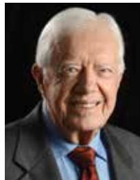
Former U.S. President Jimmy Carter

by some male religious leaders who distort the Holy Bible, the Koran, and other sacred texts to perpetuate their claim that females are, in some basic ways, inferior to them, unqualified to serve God on equal terms. Many men disagree but remain quiet in order to enjoy the benefits of their dominant status. This false premise provides a justification for sexual discrimination in