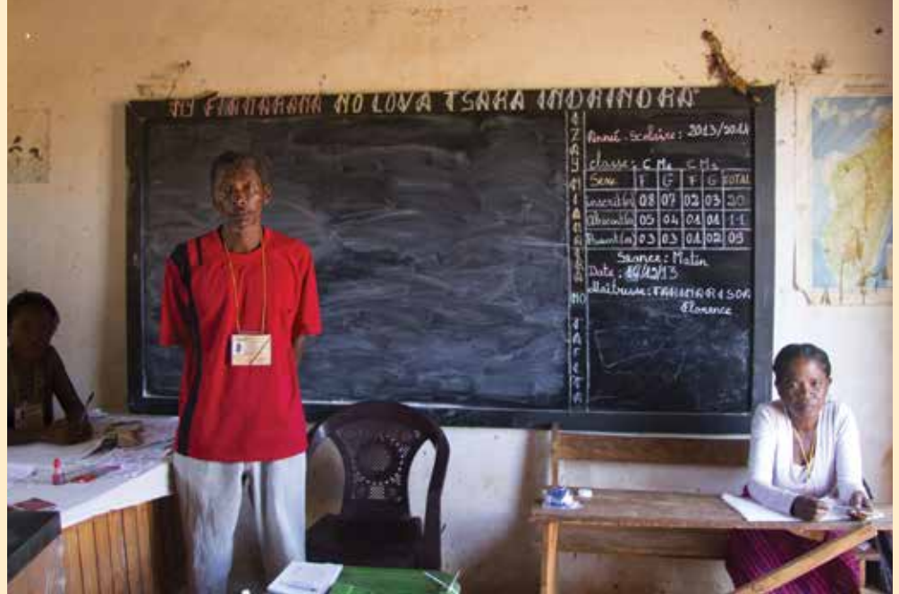
Election workers await voters at a polling station in Ankazotrano, Madagascar. The Carter Center joined the Electoral Institute for Sustainable Democracy in Africa for a joint election observation mission to the country's Dec. 20, 2013, legislative and second-round presidential elections.

Ahead of Panama's May National Assembly and presidential elections, The Carter Center worked to get broad