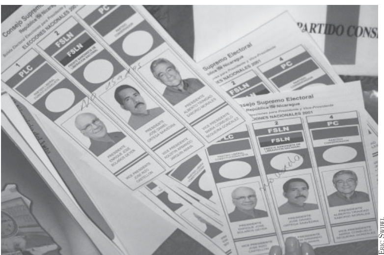
Under a new, highly restrictive electoral law, only three presidential candidates competed on the ballot in 2001.

The stipulation that an aspiring party must form directorates in all 151 municipalities is very stringent. If it is not relaxed, new parties will rarely form. To then require that parties constantly submit lists of three percent of the registered voters' signatures coupled with cumbersome procedures for verification is onerous in the extreme. The percentage should be lowered, and the verification should be limited mainly to checking whether the cedula numbers on the petition match those in the CSE records. Systematic review of massive numbers of signatures by inexpert personnel is burdensome, ineffective, and potentially arbitrary; it also encourages use of thumbprints as signatures that the country does not have the technology to compare.