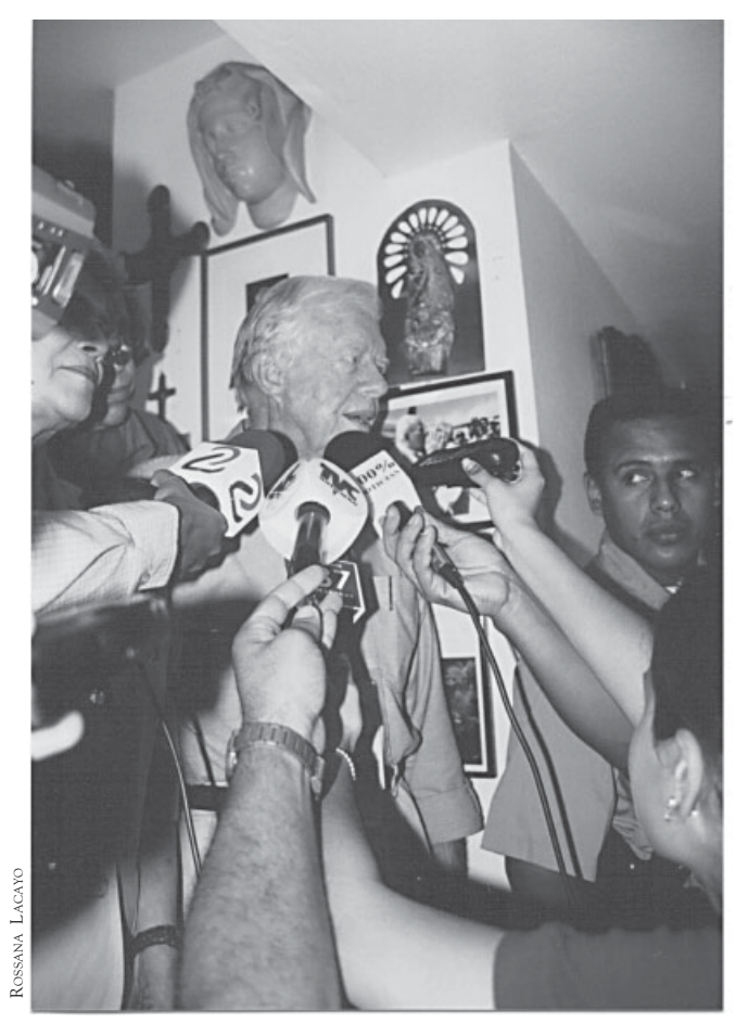
The Carter Center helps draw media attention to inform Nicaraguans and the international community about electoral developments.

At the close of this report, with all due respect, the Center offers its reflections about the current electoral system and recent performance in the hope of contributing to future improvements.