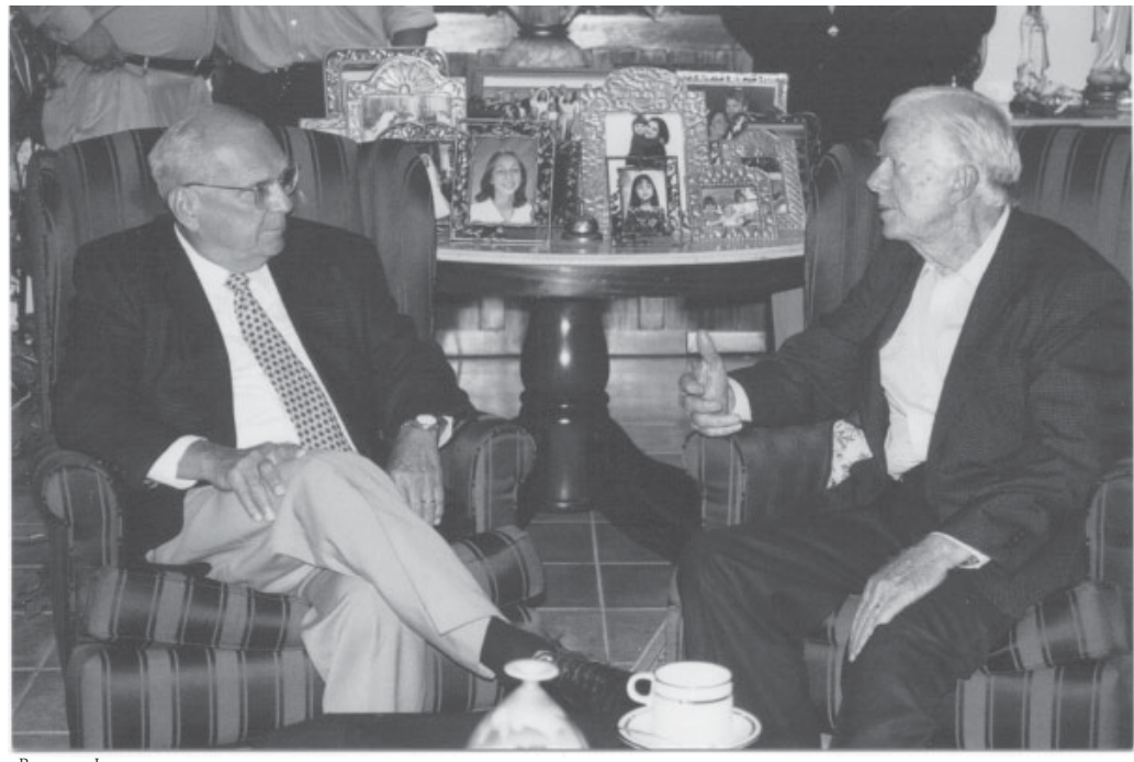
President Carter meets with then-candidate Enrique Bolaños, who would win the presidency.

The need for such reforms became more evident as the evening wore on. The night of Nov. 5, with only 25 percent of the votes fully counted, tabulation in the National Computing Center was suspended. The decision to suspend was taken amid suspicions of deliberate, politically motivated obstruction of the typing of JRV tally sheets into the CSE's computers. Just days prior to the voting, both major parties had insisted on replacing trained CSE data entry clerks with untrained people from their own ranks, something that lent itself either to obstruction or an increased incidence of human error. These new typists were still being