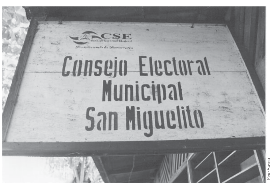
Traveling by boat, plane and four-wheel-drive vehicles, Carter Center observers reached distant towns such as San Miguelito.

The two decisions are clearly inconsistent. The election law needs to be reformed to stipulate clearly in which of the units in the territorial