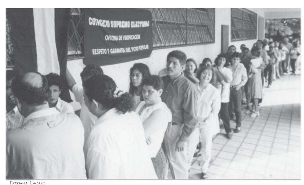
Citizens line up to vote on election day.

not demonstrate their residence in the JRV's circumscription to the satisfaction of voting officials. In some areas, the Center's observers did see significant numbers of people voting with witnesses, as the CSE had allowed. Carter Center observers recorded suspiciously high use of witnesses in Bluefields, where JRV officials permitted 63 people to vote using witnesses at a polling station with only 93 registered voters.