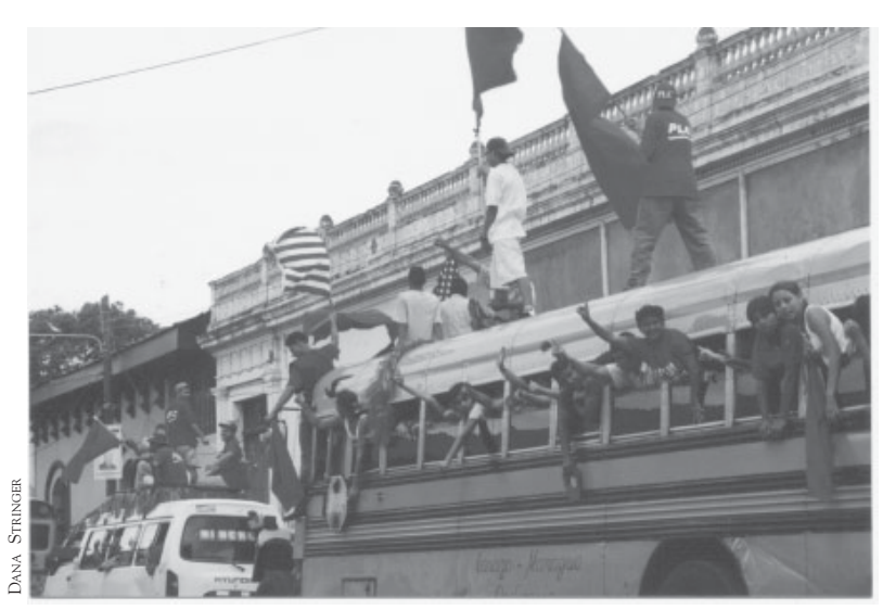
Liberal Party supporters fly the U.S. flag in a motorcade en route to a rally...

returned to monitor an election that echoed the political polarization of the past, pitting the Sandinistas against the Liberals in what at first appeared to be a tight presidential race.