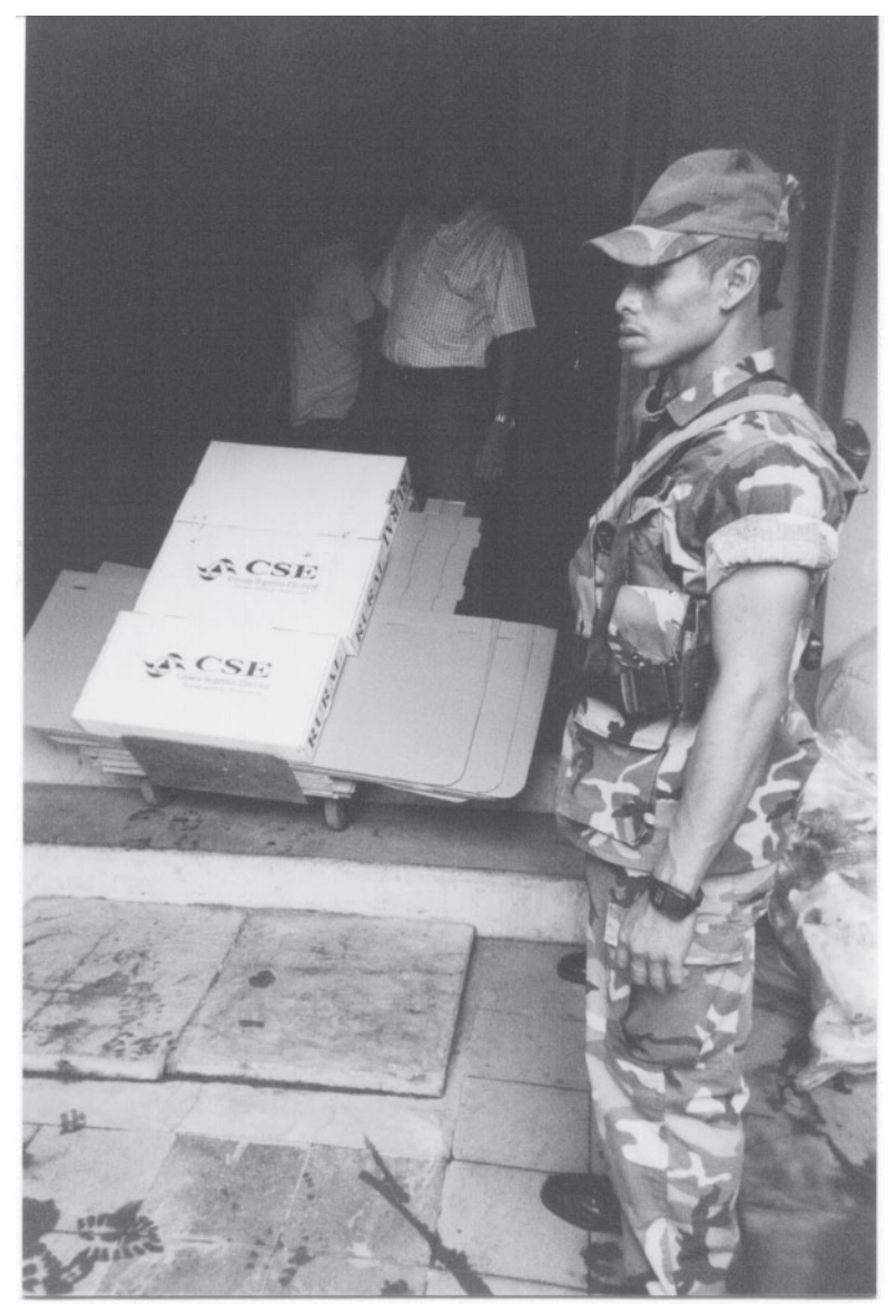
Soldiers help guard the electoral materials as part of the armed forces' assistance to the election process.

Due to such delays, it proved impossible to mount a full trial of all stages of the transmission procedure before Nov. 4.