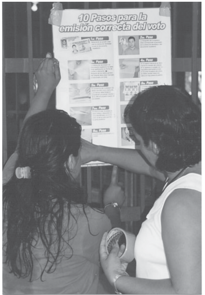
Election workers post 10-step voting instructions at a polling site.

Both major parties complained in 2001 about a lack of timely communication from the CSE, despite having representatives on that body. Many complaints centered on uncertainty about the vote transmission process, which generated fears of possible fraud. In future contests, the CSE should announce the timing and terms of transmission tests in advance, then report in full on their outcomes. Fuller and more opportune reporting in other areas as well would help bolster public confidence in the