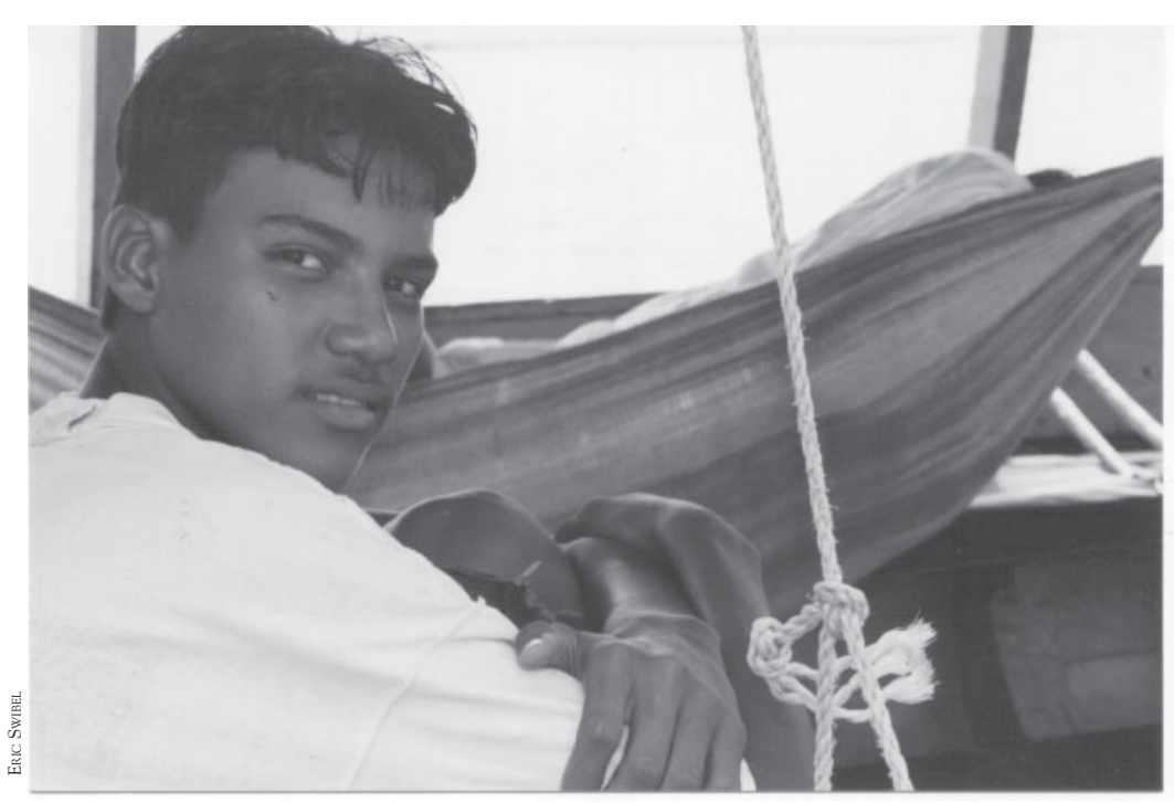
Nicaraguans look forward to democracy and development.