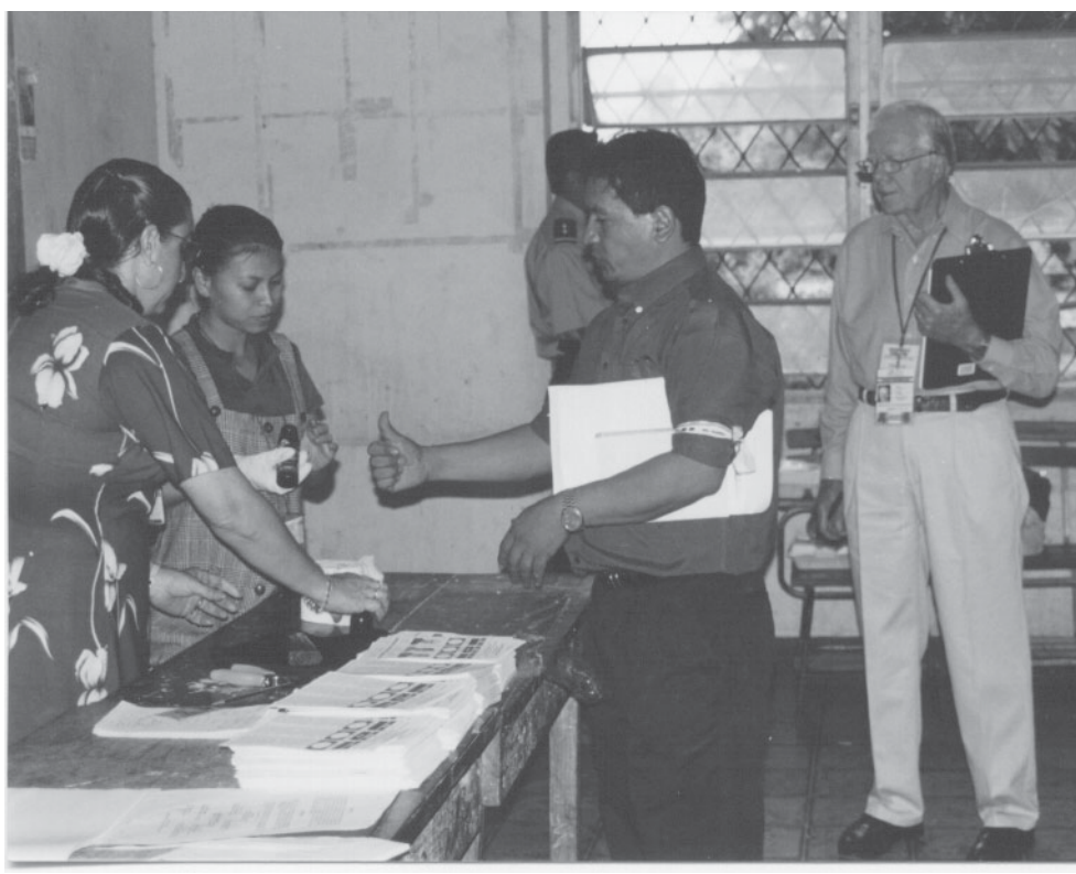
In order to prevent double voting, election workers apply indelible ink to the thumb of a citizen who has voted.

were resolved by the Departmental Electoral Councils while others were sent up to the CSE.