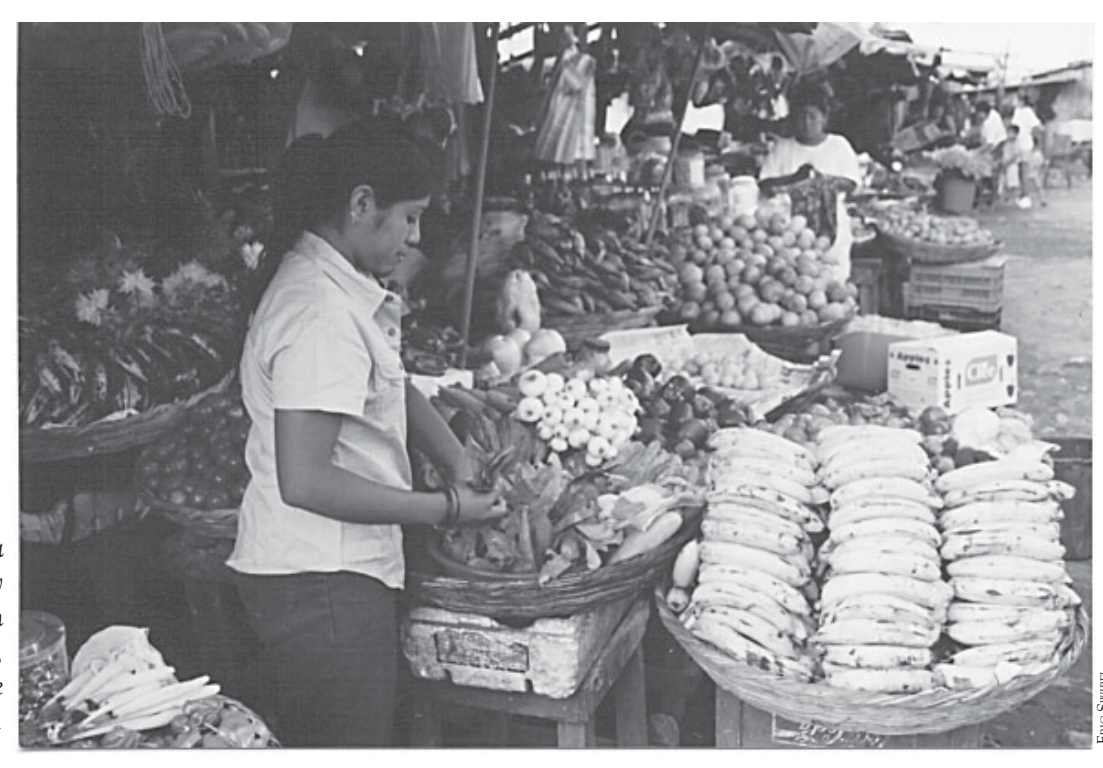
Nicaragua remains a poor country dependent on agricultural products, and its elections are expensive.

affected both jurisdictional and administrative functioning. Controversial decisions about political candidacies damaged the CSE's prestige in the eyes of the public. Mutual suspicion and rivalry between the parties represented on the Council negatively affected decision-making, planning, and implementation of the election calendar. Padding of the CSE's rolls with party appointees served to raise costs unjustifiably. The first step in any genuine reform of the election administration is therefore to dilute partisanship and blatant political criteria in decision-making and recruitment. Other steps concern the organization and operation of the electoral authorities at various levels, while still