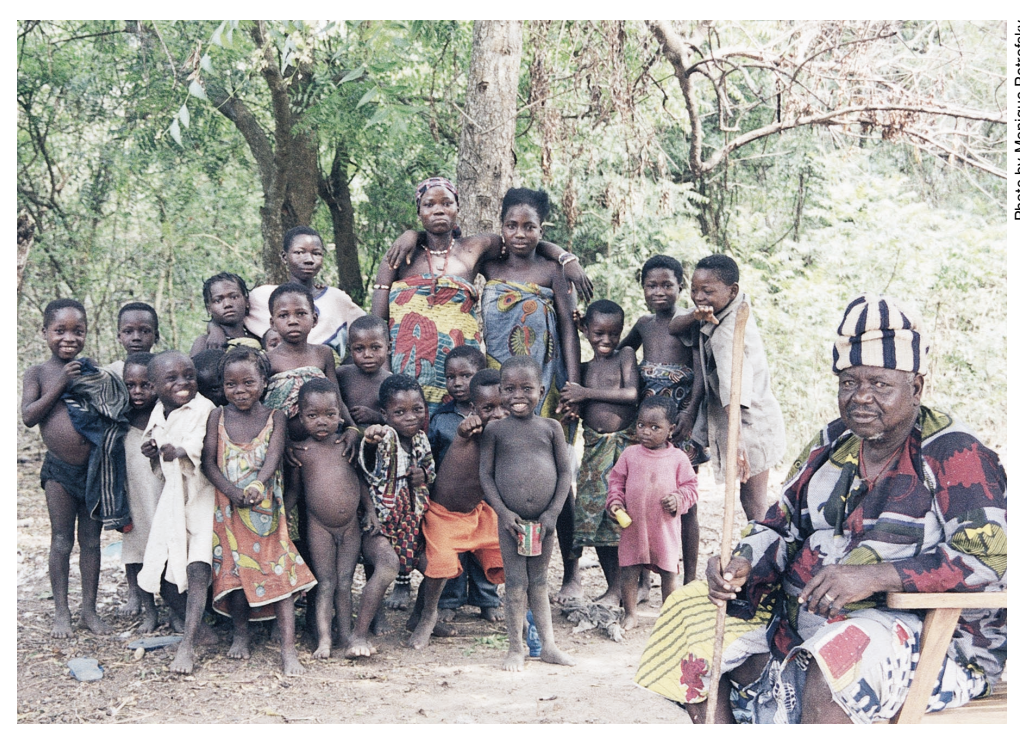
Mothers in the community are an important human resource as they teach others how to eradicate Guinea worm disease.

With support from the villagers of Tchetti, one mother rallied against a negligent village volunteer when this man refused to report an outbreak of Guinea worm disease because he did not want to be embarrassed. The social assistant went to the local radio station, which routinely aired messages about preventing the