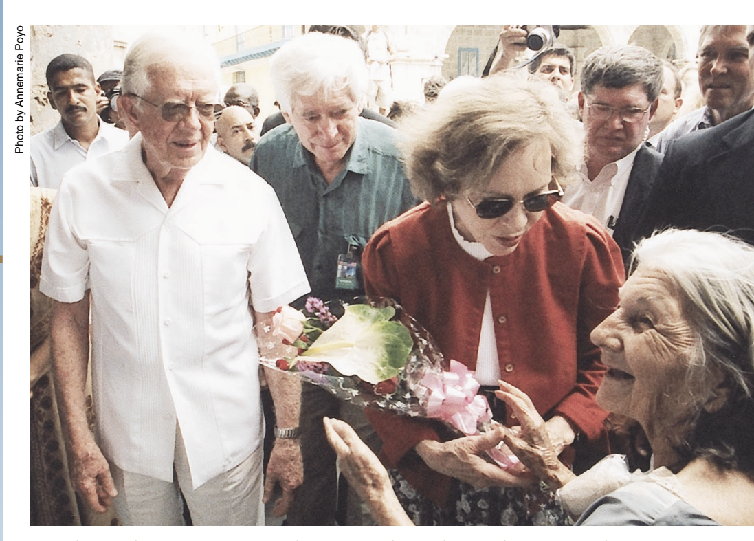
President and Mrs. Carter enjoyed a warm welcome from Cuban citizens during a walking tour of historic Old Havana.