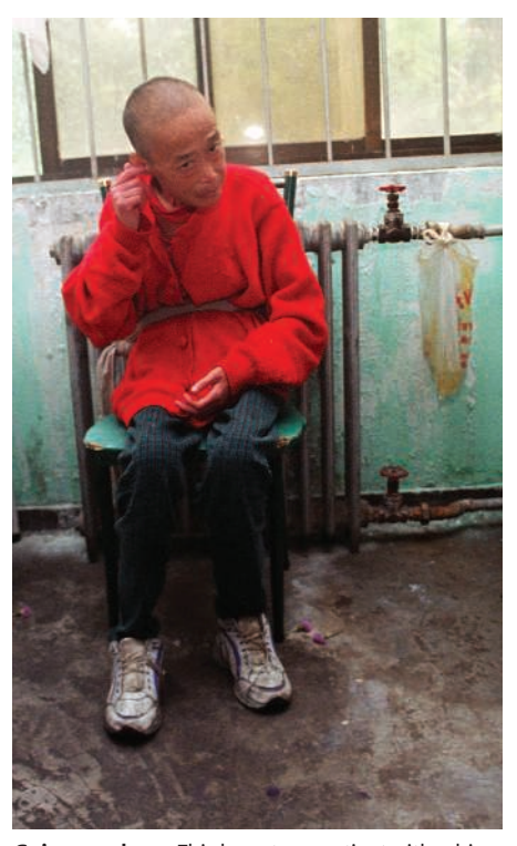
Going nowhere. This long-term patient with schizophrenia is chained to a radiator in a Beijing hospital.