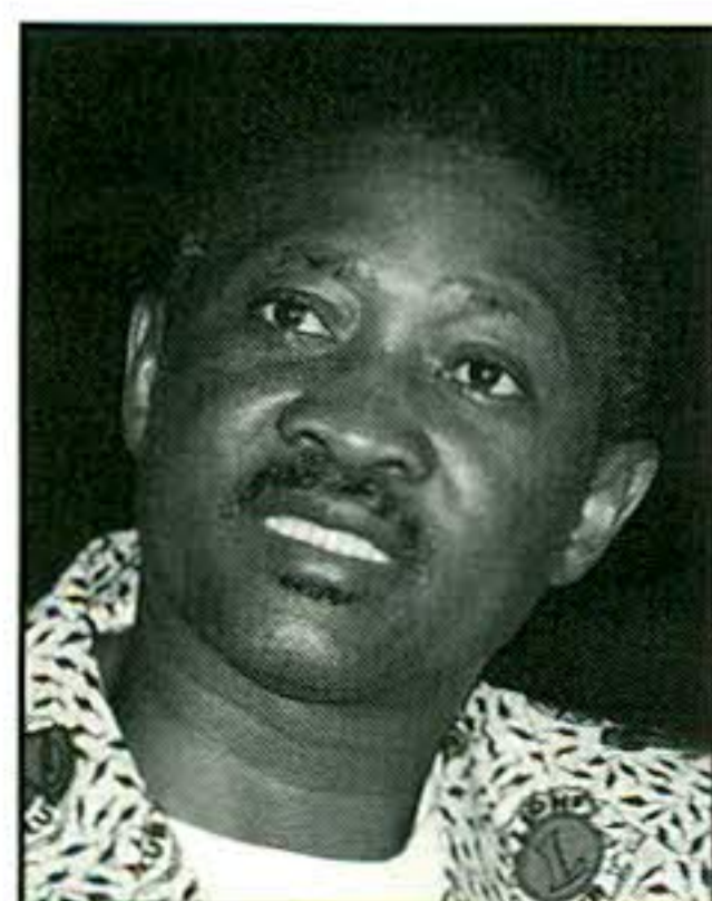
Gen. Amadou Toumani Touré

Every general knows that most battles are fought in the trenches. The war against Guinea worm disease is no exception.