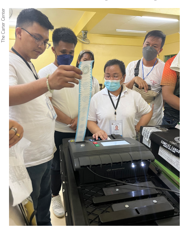
A vote counting machine generates a certificate of canvass.

Initial vote counting is done electronically by each VCM. At the end of polling, the precinct officials close the VCM and follow procedures, which must be public and uninterrupted, to ensure the transmission of results and the generation of copies of result protocols (known as "certificates of canvass"). <sup>23</sup> In addition to representatives of candidates and of political parties ("poll watchers"), observers are entitled to be present during all phases of the voting, canvassing, and transmission procedures. <sup>24</sup> Representatives of political parties and of the election observation organization recognized