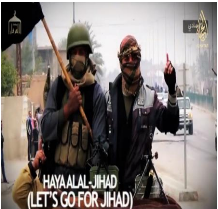
Screenshot from the November 2015 video

Of the 437 videos analyzed for this report, 204, or 47 percent, were focused on graphic images of warfare, the most dominant of the seven narratives in the model. While other narratives describe life in the caliphate as a utopia, narratives focused on military jihad provide an action plan for potential recruits while also highlighting events or persons working to actualize Daesh's military goals. Daesh ideology redefines the term jihad exclusively as outward violence against those unwilling to adopt their strict worldview, Muslims and non-Muslims alike. These videos articulate grandeur and heroism in idealized military engagements; combat is glorified to create a warrior