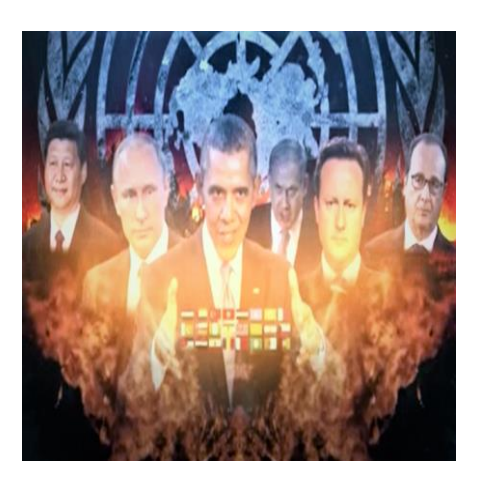
Screenshot from a late-2016 video showing then-President Obama as leading a global anti-Islam coalition

Daesh emphasizes Western transgression in the Muslim world to stress historical grievances and justify attacks as a legitimate response. Videos fueled by this narrative often show in agonizing detail the bodies of children allegedly injured or killed in Coalition airstrikes.<sup>2</sup> Narratives like these assert a defensive position and seek to establish a hyper-intensified moral space for potential recruits. Battle lines are drawn and action is demanded. Most of these videos are in Arabic, but with subtitles in Western languages (especially French and English). In June 2014, Daesh