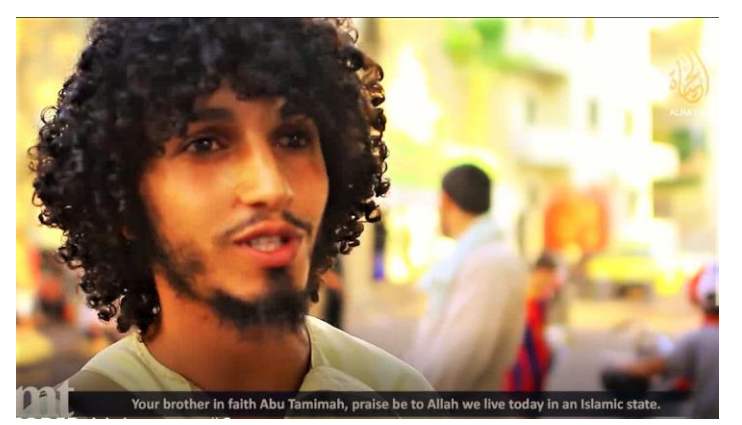
Figure 1: Screenshot of young man featured in Mujatweets, Episode #6, extolling the virtues of Daesh.

In contrast to the uncensored violence of the jihad narrative, utopian videos use positive branding to emphasize the benefits of life under Daesh's black flag. Narratives related to this utopian vision comprise 32 percent of videos analyzed by the Center. Daesh taps into socioeconomic grievances of different Muslim communities by offering footage of social services and prosperity, paired with audio condemning corrupt governments and sociopolitical structures. These videos