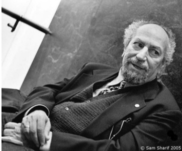
Dr. Saad Ibrahim Egypt

His call for democracy and human rights in the Middle East has risked his life and health, but Ibrahim's persistence continues to spark dialogue for advancement of democratic principles.