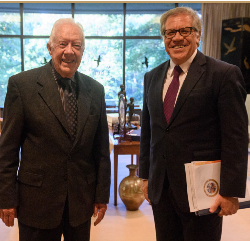
Former U.S. President Jimmy Carter and Luis Almagro, secretary-general of the Organization for American States, in July 2017 at a Friends of the Inter-American Democratic Charter meeting.