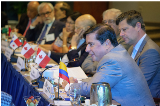
Juan Fernando Cristo, former Colombian minister of the interior and member of the government's peace negotiation team, speaks to the Friends of the Inter-American Democratic Charter about the Colombian peace process.

The Carter Center works closely with the Organization of American States to strengthen regional capacities and serves as the secretariat of the Friends of the Inter-American Democratic Charter, a group of former presidents, prime ministers, cabinet ministers, and human rights experts. Through quiet diplomacy and fact-finding missions, the Friends listen to disputing parties in country conflicts, encourage peaceful and constitutional means to resolve democratic conflict, focus international attention at critical political moments (including elections), and contribute to more informed diplomatic actions. Among other activities, the program organized a high-level political mission for the Guatemalan election in 2015, a study mission for the Peruvian election in 2016, and a consultation for the Honduran election in 2017. Electoral reform and more inclusive political participation are current priorities for LACP activities.