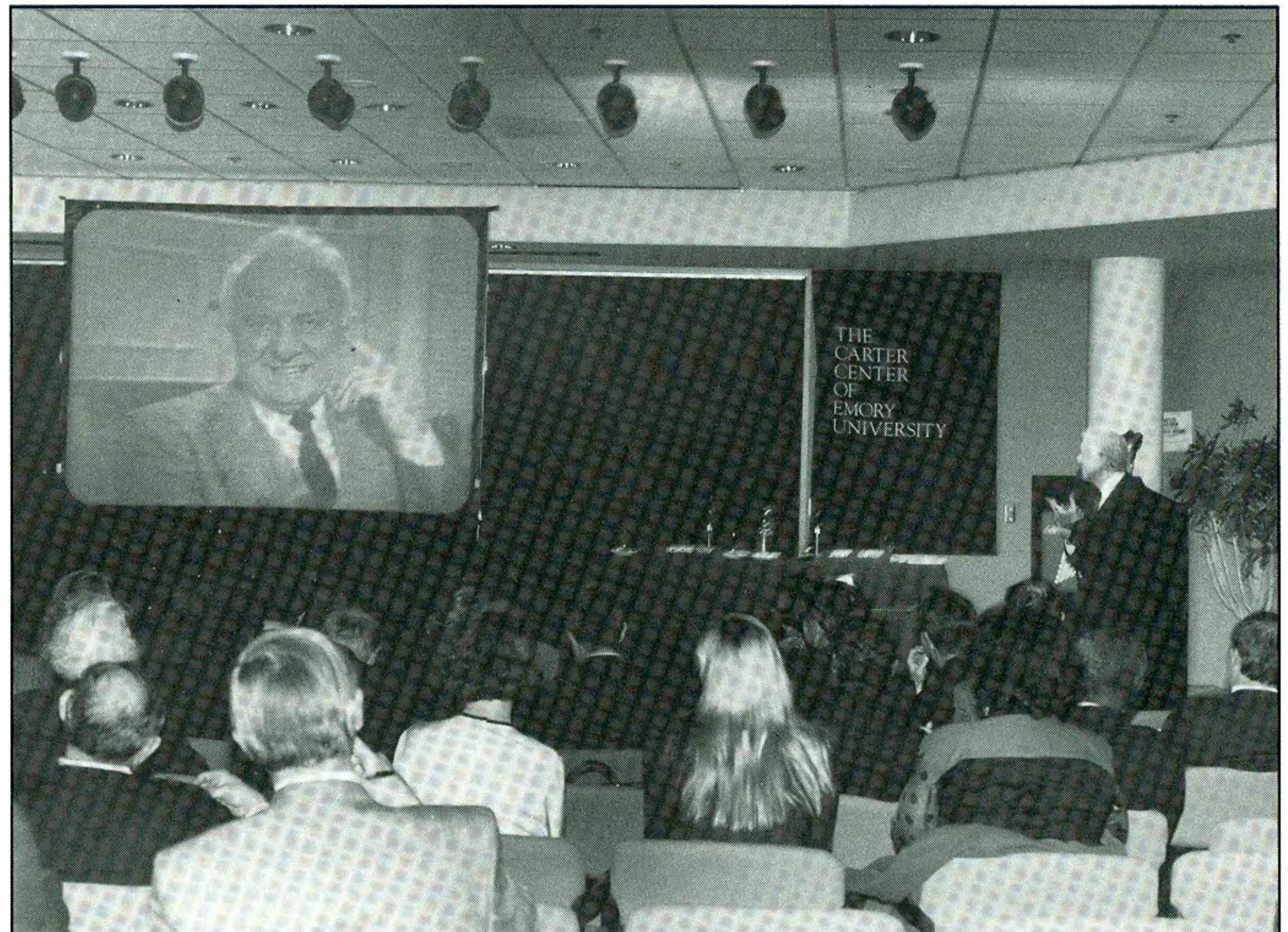
INN Council Member Eduard Shevardnadze participates in the consultation via satellite from Moscow.

nents were represented among the former heads of state, scholars, government officials, and leaders of relief, religious, humanitarian, and international organizations in attendance. Using their wide range of skills, the group developed plans to resolve specific conflicts peacefully. Participants also shared insights into the principles of conflict resolution in today's world.