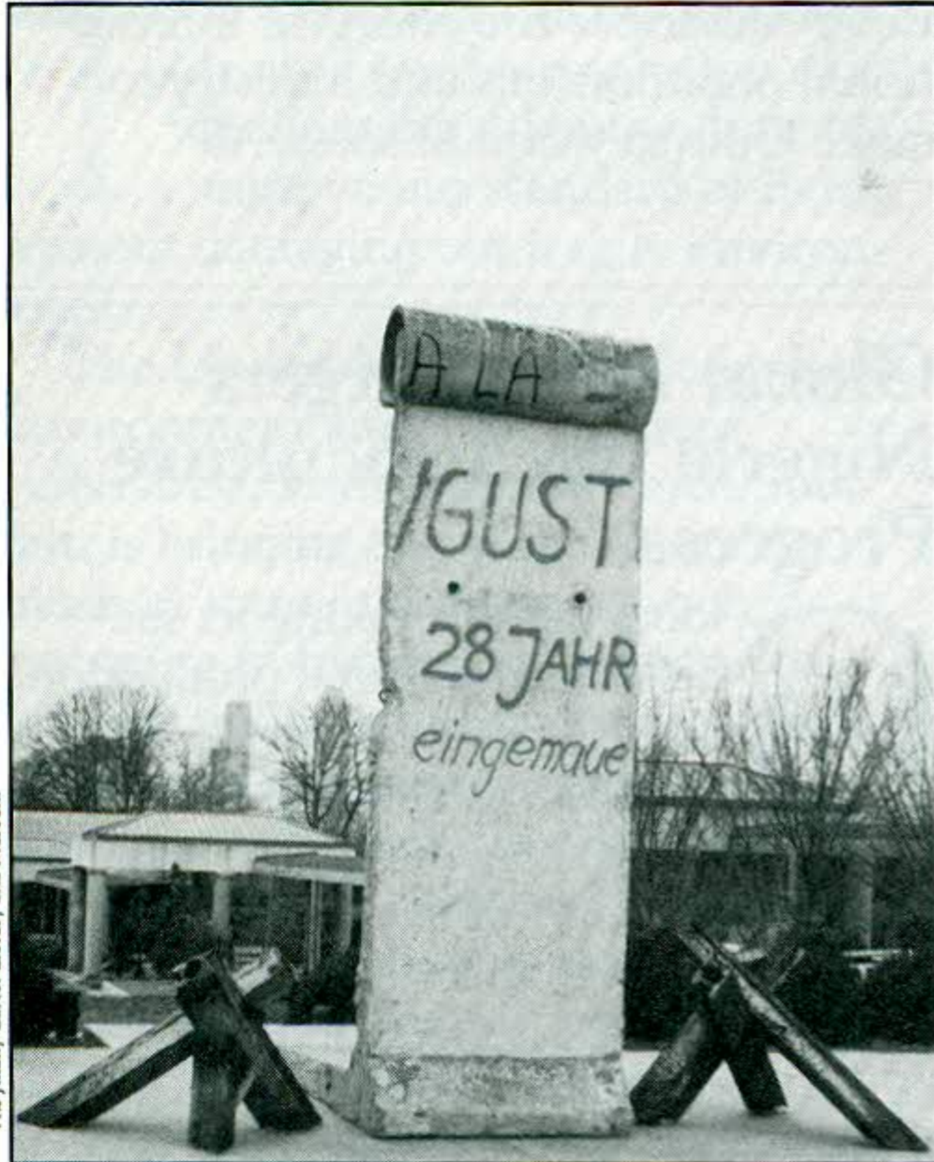
A piece of the toppled Berlin Wall symbolizes the fall of Communism.

Three years after its fall, the Berlin Wall went back up in Atlanta this spring.