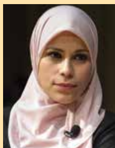
Dr. Alaa Murabit

When Alaa Murabit was 15, she graduated from high school and moved with her mother from Canada to her mother's hometown in Libya.