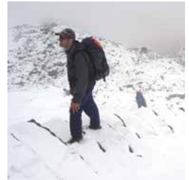
During their long-term mission to monitor democratic transition in Nepal, Carter Center observers traveled to cold and remote mountain villages.

Observers monitored elections in Egypt only to watch democracy backslide, yet we have not given up hope for an opening in the future. Several years ago, civil unrest kept Carter Center health staff out of northern Uganda, so we focused on treating river blindness in the South. Now health workers can move about the entire country to treat river blindness and other diseases. While Ebola ravaged