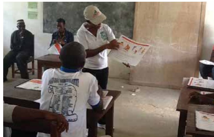
The Center helped educate elders and chiefs about proper Ebola protocol. They could then spread accurate information to their community members.