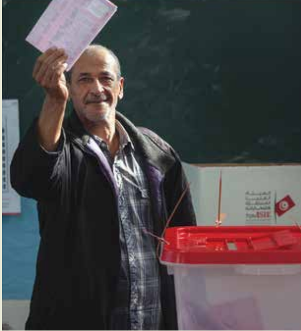
A Tunisian man shows his ballot before casting his vote for president at a Tunis primary school in November. Carter Center observers monitored voting.

A study by The Carter Center details barriers Guatemalan women face in accessing government information.