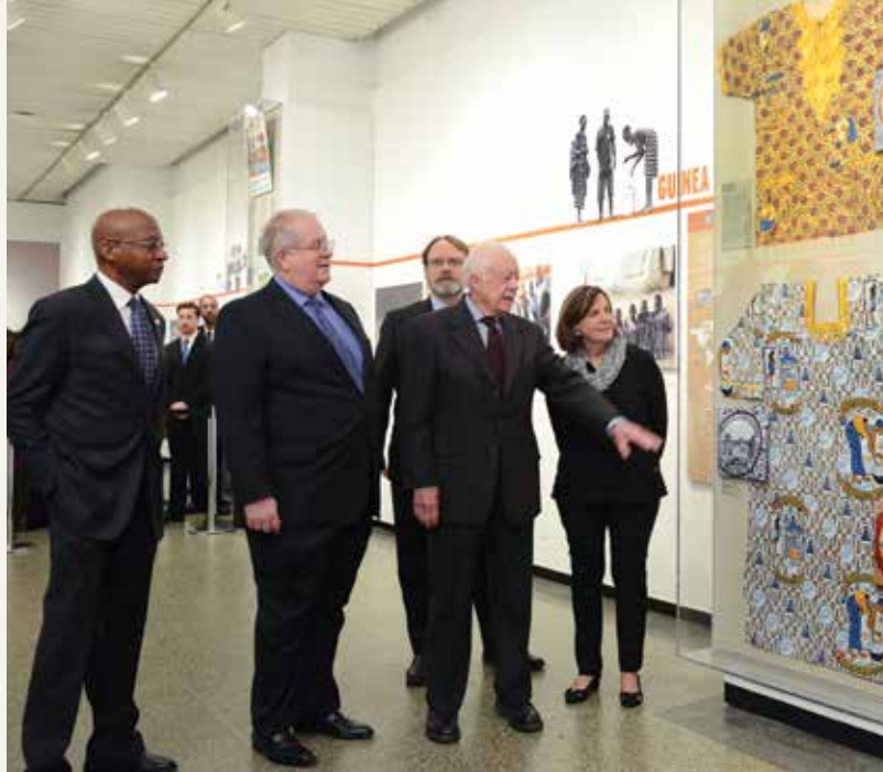
At the opening of the "Countdown to Zero" exhibit at the American Museum of Natural History, former U.S. President Jimmy Carter explains how pictures on clothing from some African countries is used in the fight against Guinea worm disease. The exhibit's run has been extended to January 2016.