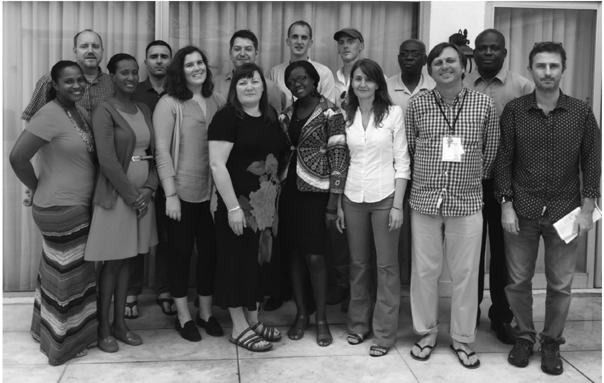
The Carter Center

Carter Center observers and staff on this mission had the privilege of working on the Center's 100th election observation.