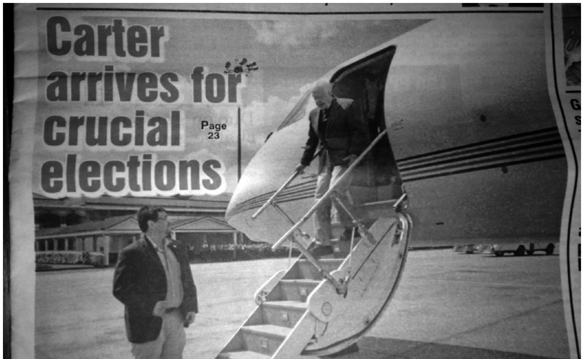
The Carter Center

President Carter led the Center's fourth observation mission to Guyana, reflecting the Center's commitment to the country.