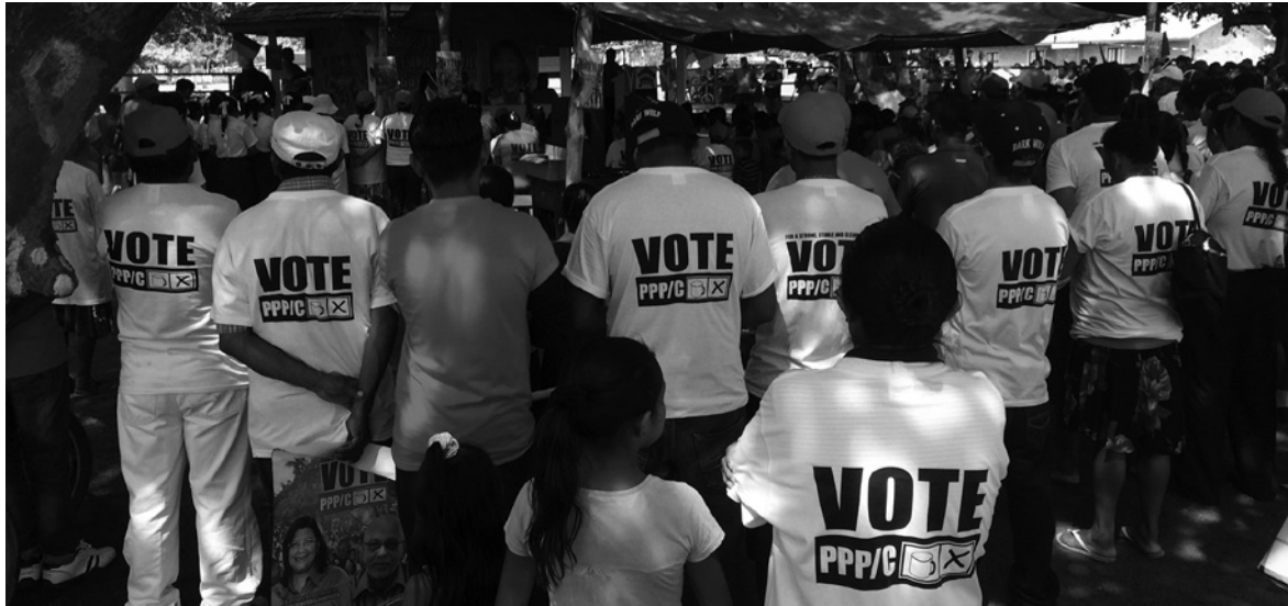
The Carter Center observes a rally of the incumbent People's Progressive Party/Civic. The party had been in power for 23 years prior to this election.

The only legal requirement for a party to participate in elections is to field lists in at least six of the 10 districts. Six parties, including one coalition, submitted lists for the National Assembly elections. In addition to the People's Progressive Party/Civic and APNU–AFC, these were the United Force, the United Republican Party, the Independent Party, and the National Independence Party. Two additional parties, the Healing the Nation Theocracy Party and Voice of the People, fielded candidates for the regional elections in Region 4. Although six national lists participated in the election, the two largest blocs garnered almost the entire attention of the media. The smaller parties' campaigns were largely invisible, with very low levels of activity. The two main parties, by contrast, were extremely visible.