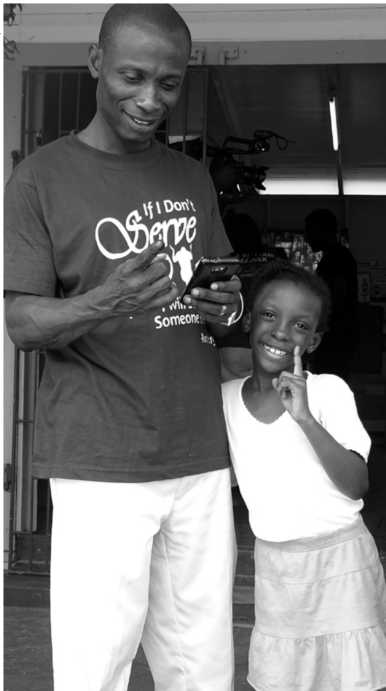
A young future voter is proud to stand by her father, who shows his ink-stained finger that indicates he has voted.