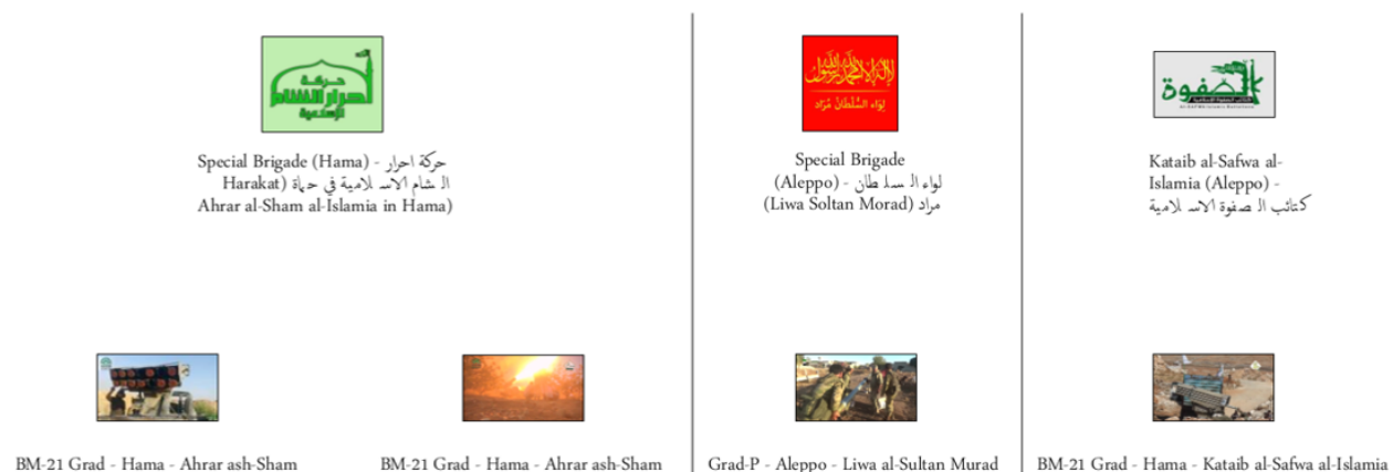
Figure 1: Three armed opposition groups and their corresponding shelling events

The overwhelming majority of these weapons were claimed to have been deployed against pro-government forces as part of the Marwan Hadid offensive in Hama or the ongoing counteroffensive in Aleppo. There is only one exception to this, a few missile strikes from a Grad-P system conducted by Liwa al-Sultan Murad on ISIS in the countryside of Aleppo.