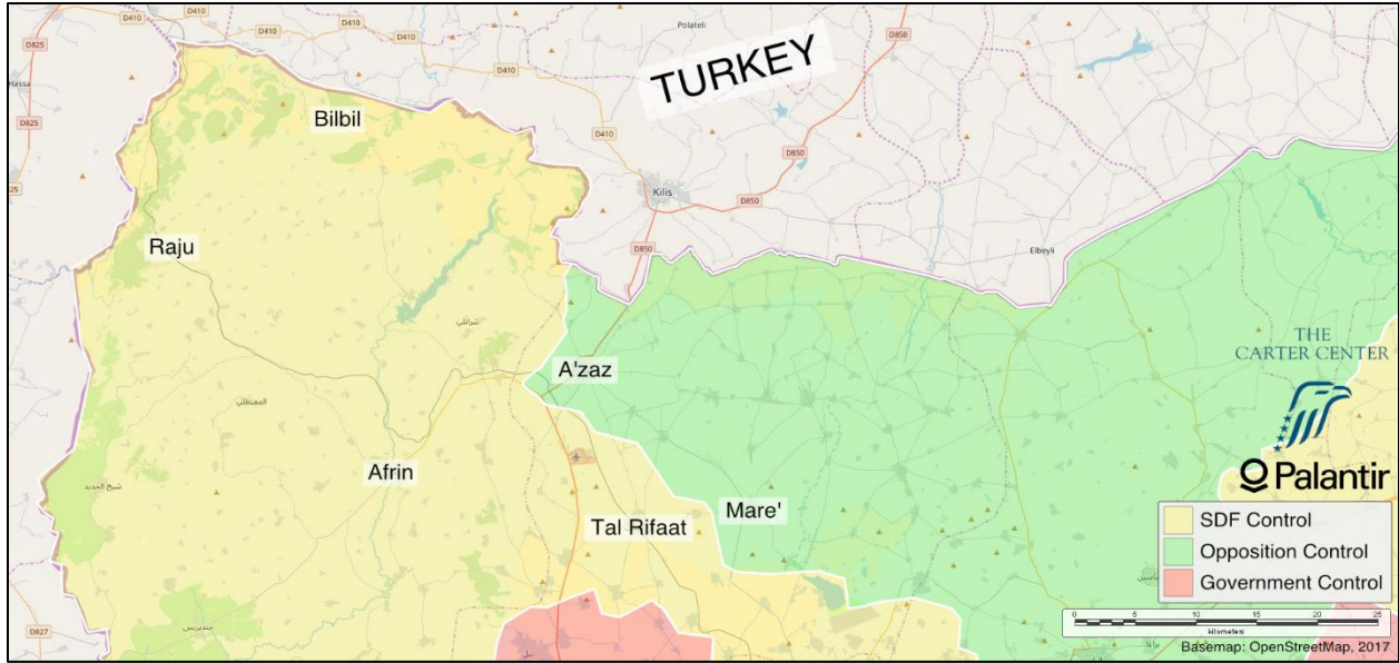
Figure 3 - Areas of control at Syria's northwestern border with Turkey by January 17. Opposition areas should be seen as mixed Turkish-opposition control.