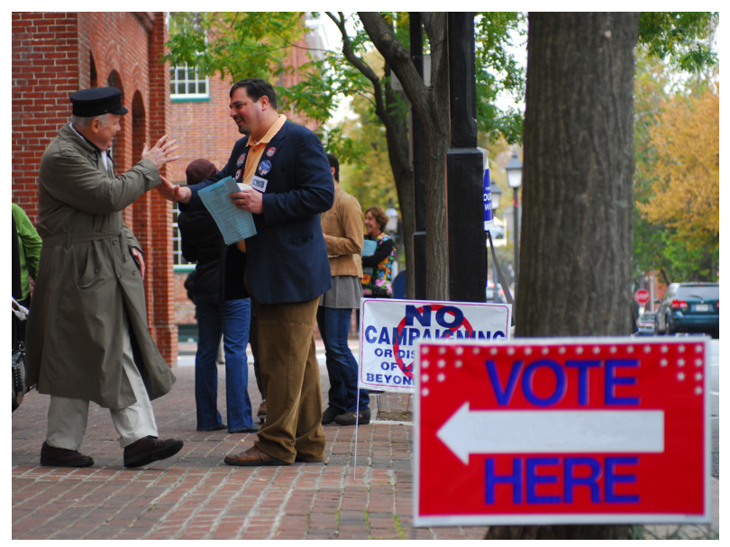
Community members greet outside a polling station.

NATIONAL CONFERENCE of STATE LEGISLATURES The Forum for America's Ideas