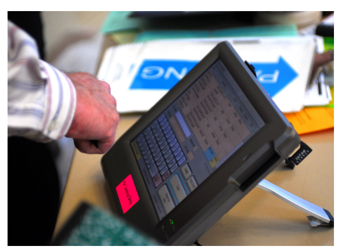
An election worker uses this electronic poll book to check in voters.

In remaining states there is no statutory guidance for international observers nor a known practice on permitting or prohibiting international observer access.