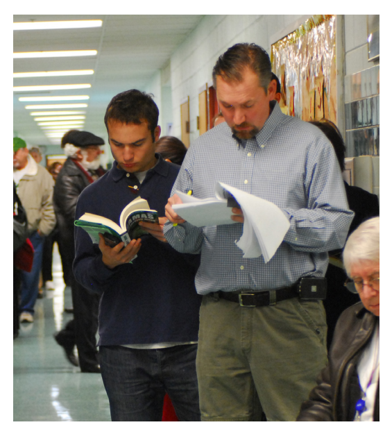
Voters wait in line to cast their ballots.