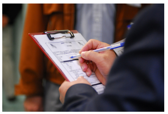
Observers typically use checklists to systematically gather data from across polling stations on Election Day.

Following the decision of the Supreme Court in Shelby Co. v Holder (2013), the number of federal observers deployed in 2016 was much smaller. For the 2016 presidential elections, four states (Alabama, Alaska, California, and Louisiana), determined by court order, had federal observers, making it the smallest deployment since the passage of the Voting Rights Act. DOJ can send its own staff to observe elections, but only with permission from the local jurisdiction.